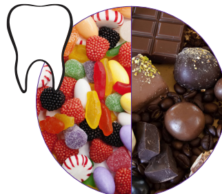
Sweets and chocolate