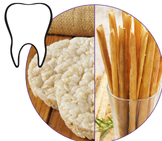
Breadsticks and rice cakes